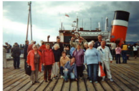
ELI G members and others on a recent trip "Doon the Water" on the Waverley steamer

After the success of our "Network Challenge" quiz night back on 20 November last, we are continuing our social programme with another event planned to take place at the end of February 2009. Further details will be circulated nearer the time.