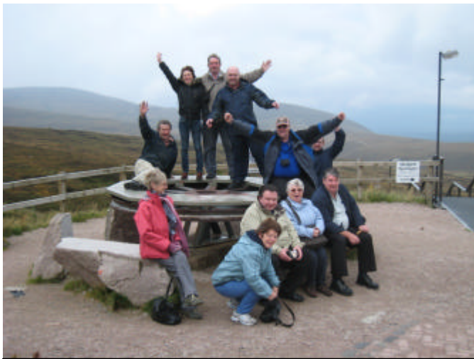
Tyneparkers "On Top of the World" on holiday in Aviemore